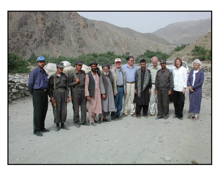
Scottsbluff-Gering / Bamiyan, Afghanistan Sister Cities